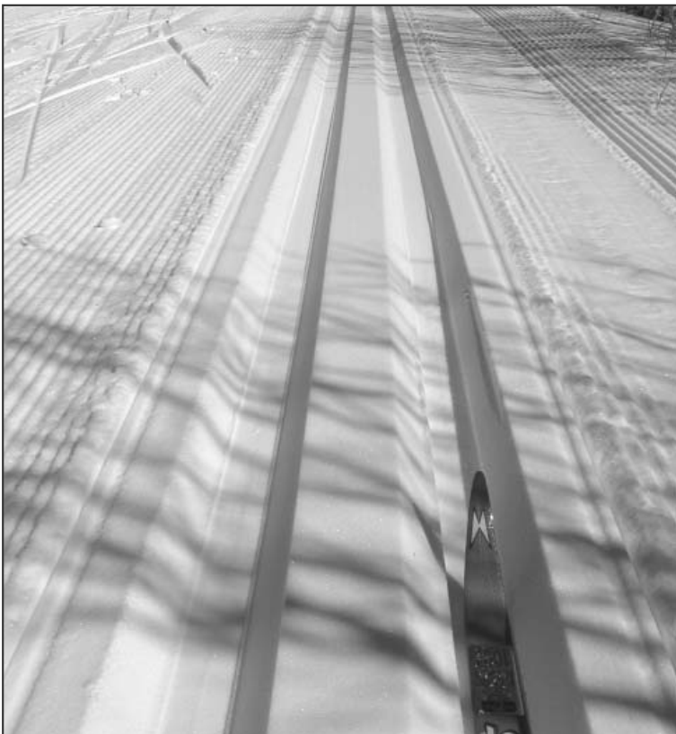
Beautiful Grooming on the Onion River Road

Both snowmobiles and the Pisten Bully are necessary to provide a quality grooming job on the entire trail system. 😊